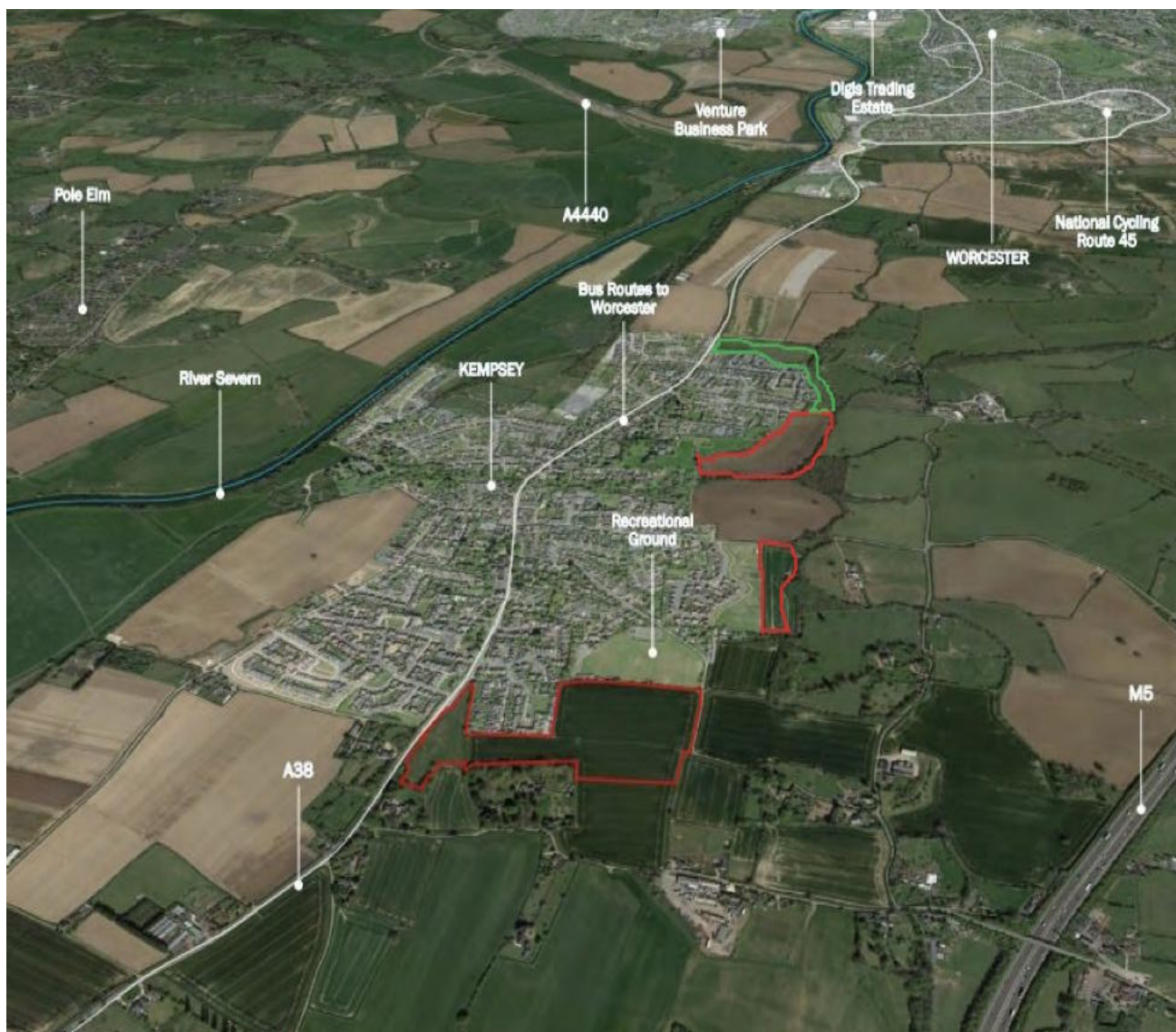
Aerial view of proposed housing developments.

In another busy year we considered around 45 applications, mainly for planning permission for new development but also for works to listed buildings and to display advertisements. Unsurprisingly, it is the larger schemes which have required most attention because they will affect the Parish most and because of the numerous reports and plans which come with them. They have included housing and employment developments in the South Worcester Urban Extension (SWUE), particularly between Broomhall Way and Taylors Lane, where building is already well underway, as shown in the aerial view below.