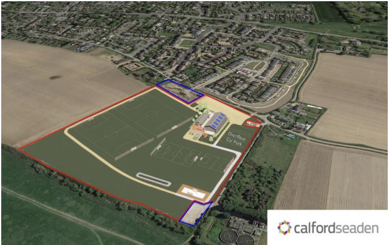
Artist's representation of the proposed site layout seen from the west

The design includes provision for a skate park and BMX track (to be funded separately) towards the west of the site as well as opportunities for adding picnic areas, a demonstration mini-orchard and wild flower and habitat bio-diversity areas for both environmental and educational purposes.